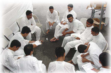
Brainstorming sessions yield productive solutions

Sponsored messages may be promoted in announcements, press releases, banner displays and on even keepsakes.