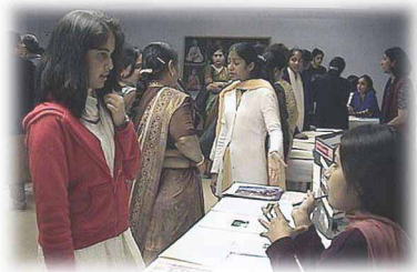
College and Career Fair, Edison, NJ - 11/2003