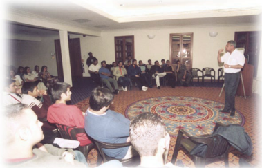
Vocational Guidance Seminar