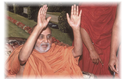
Swamishri blesses an audience of young children

BAPS, a worldwide organization in Consultative Status with the Economic and Social Council of the United Nations, is dedicated to community service, peace and harmony. BAPS strives to provide cultural and social care for society and is renowned for its dedicated youth volunteer force of 55,000 around the world. BAPS conducts humanitarian and social activities through a worldwide network of more than 8,100 centers, including 4,070 youth centers. BAPS' efforts include youth leadership conventions, natural disaster relief, recycling drives, water conservation, educational, and parenting programs. Recently, BAPS helped the victims of the deadly California fires by providing shelter and counseling services. In addition, BAPS helped firefighters and victims of the 9/11 tragedy. BAPS was also instrumental in the recovery, relief and rehabilitation efforts in Western India after the devastating earthquake in January 2001.