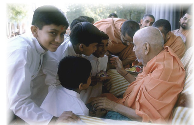
Swamishri mingles with the youth – Anand, India