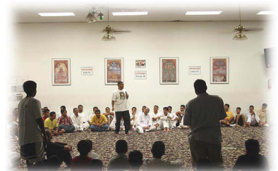
Group discussion encourages exchange and learning