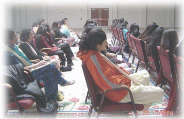
Midwest Regional young ladies convention, Chicago, IL - 12/2003