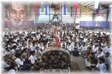
Swamishri narrates a story to young children – Perry, GA