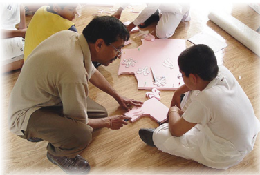
Bal Summer Training Camp, Edison, NJ - 06/2003