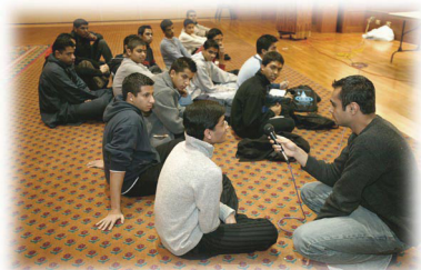
Group discussions held among aspiring students