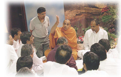
Receiving from the learned