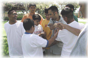
Icebreaker activities help participants get to know one another