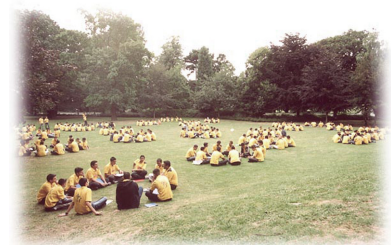
Young participants learn while playing during BAPS summer camp

In order to encourage a high level of participation in such highly effective, family and community enriching conventions, BAPS provides subsidized food and lodging for all participants. BAPS volunteers holding the convention are responsible for their own transportation costs to and from convention sites. Other costs are fully paid for by BAPS, such as convention facility rental and operating expenditures including production of teaching material and event keepsakes. These costs are offset, in part, by corporate sponsorship opportunities that support this valuable community enhancement endeavor.